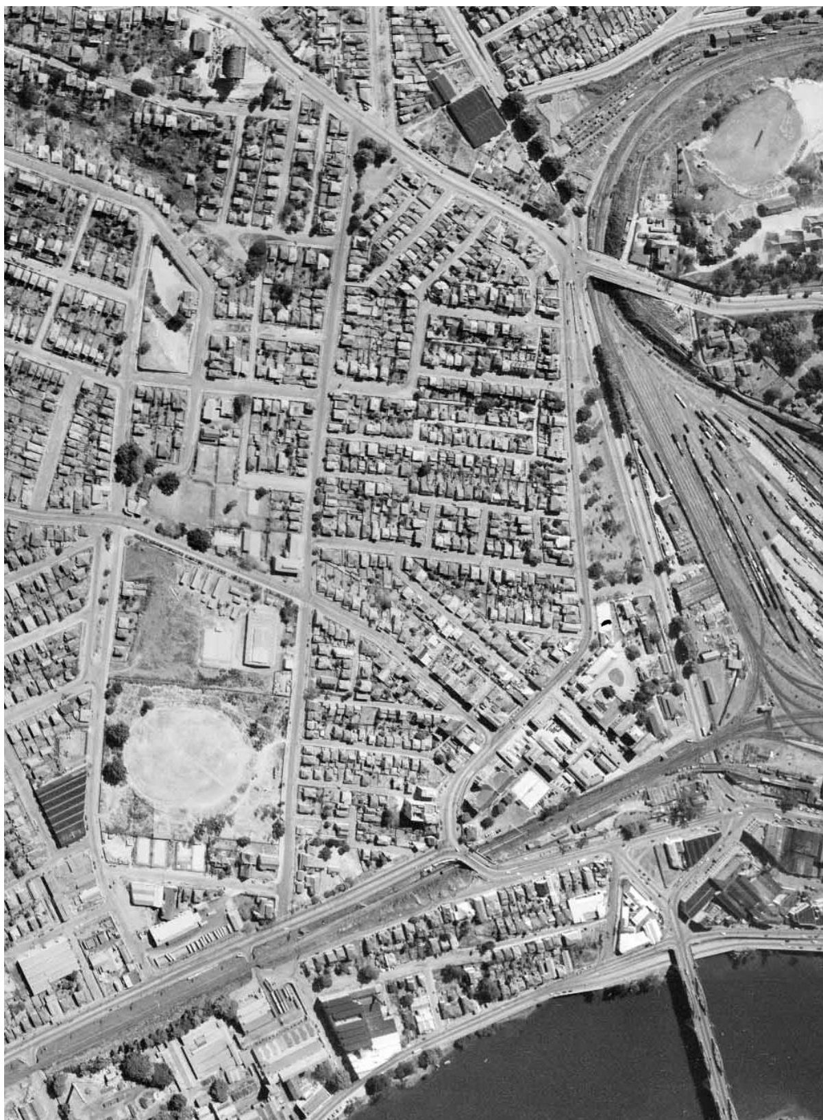
1951 Part aerial photograph BCC 000539333